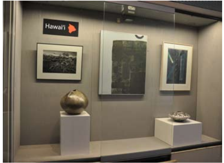
The new Hawai'i Island display.

Thousands of local residents and visitors attend events at the Hawai'i Convention Center in Honolulu every year.