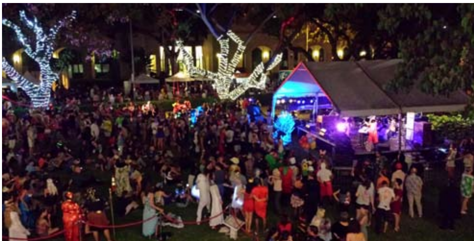
Hallowbaloo celebration on HiSAM’s front lawn.

All this, and let’s not forget HiSAM is staffed by two full time employees: many people are volunteering to make this a truly exciting community place. Join in supporting the Friends of HiSAM in their bid for a Levitt grant to support live music programming at HiSAM next summer. (For details see www.levittpavilions.org ).