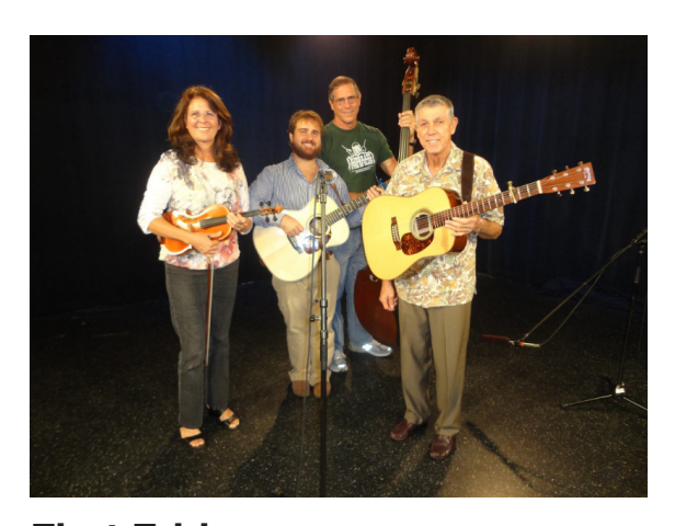
First Friday Friday, November 4 6:00 - 9:00 PM North Shore Ramblers

Live bluegrass music with the <u>North Shore Ramblers</u>. The Hawai'i State Art Museum galleries will be open, including the "I Love Art" hands-on activity room. Join us for a family-friendly evening with local artists and arts enthusiasts! Second floor Sculpture Lobby.