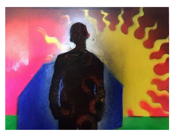
Art Lunch Tuesday, November 29th 12:00 - 1:00 PM Visual Literacy 101

First Friday: To be announced Second Saturday: Lauhala weaving Art Lunch: cancelled due to holiday. Art Lunch will resume in January.