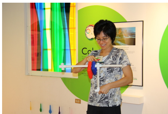
Photos (L to R): Interpreting visual art through drama. Making sculpture in the I Love Art gallery at HiSAM.